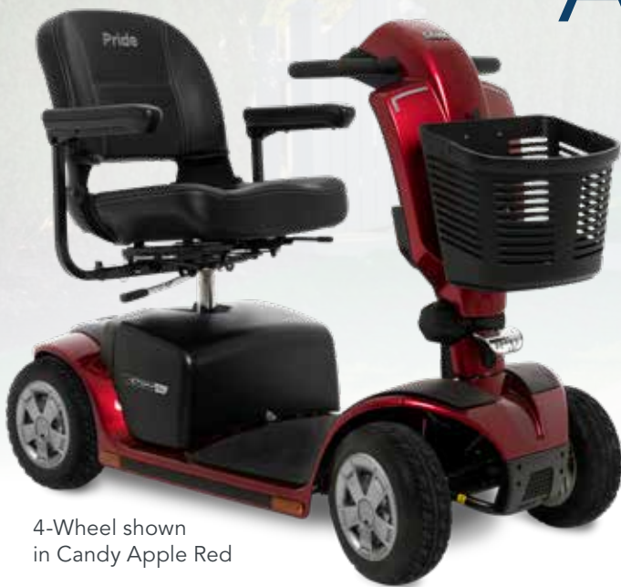
4-Wheel shown in Candy Apple Red